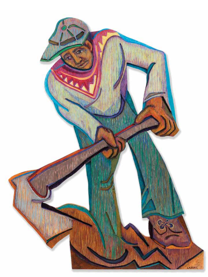
Migrant Farm Worker We depend on them