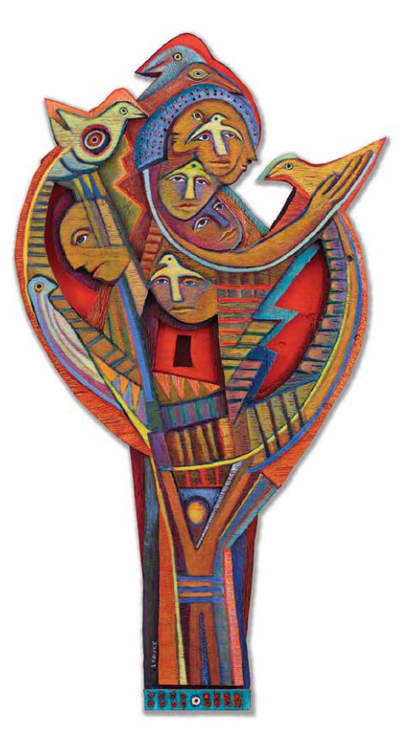
Am | Next? School Shootings