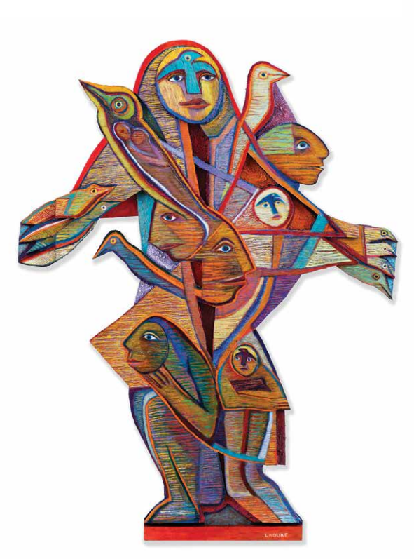
Blowing in the Wind When will we ever learn