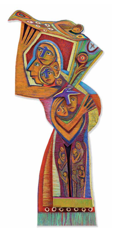
Rohingya Refugees From Myanmar to Bangladesh