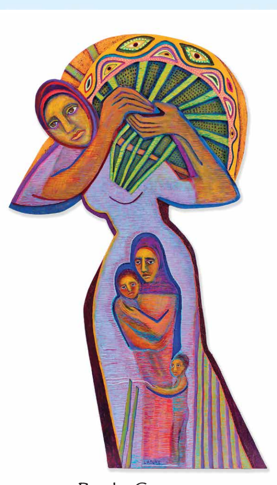
Border Crossings Millions of refugees worldwide