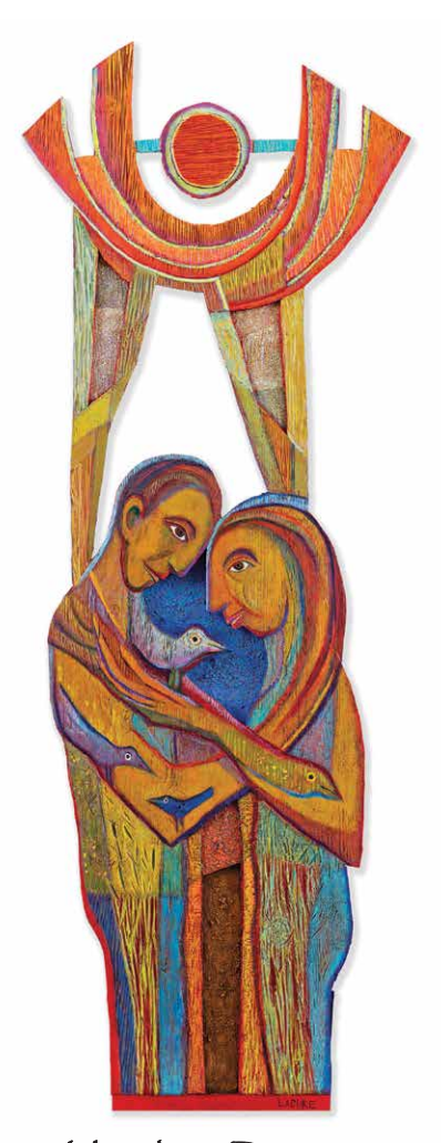
Hiroshima Dreams No More Nuclear War