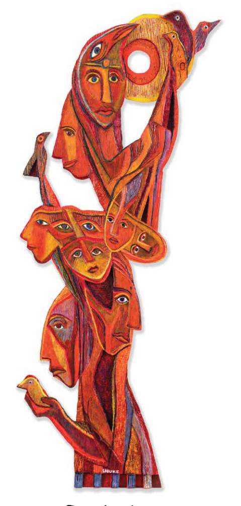
Paradise Lost Devastating Wild Fires