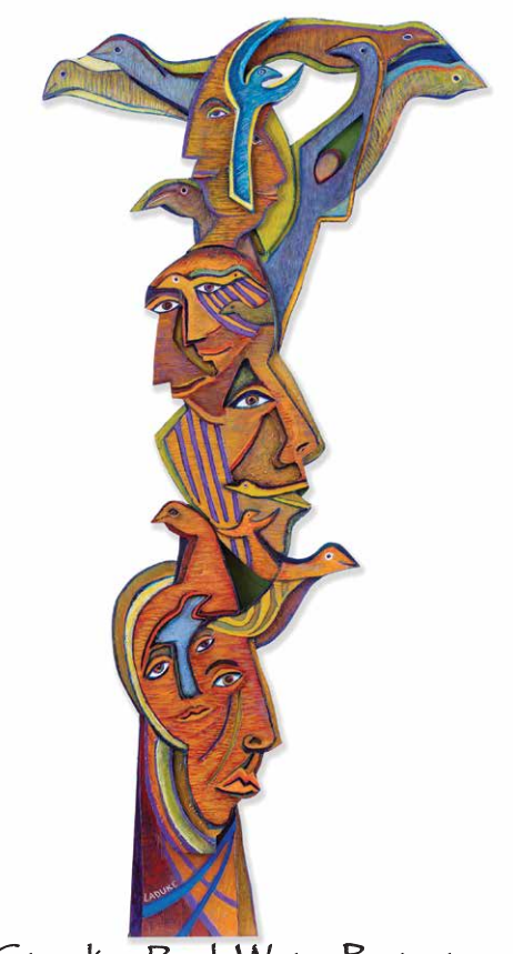
Standing Rock Water Protectors Water is Life