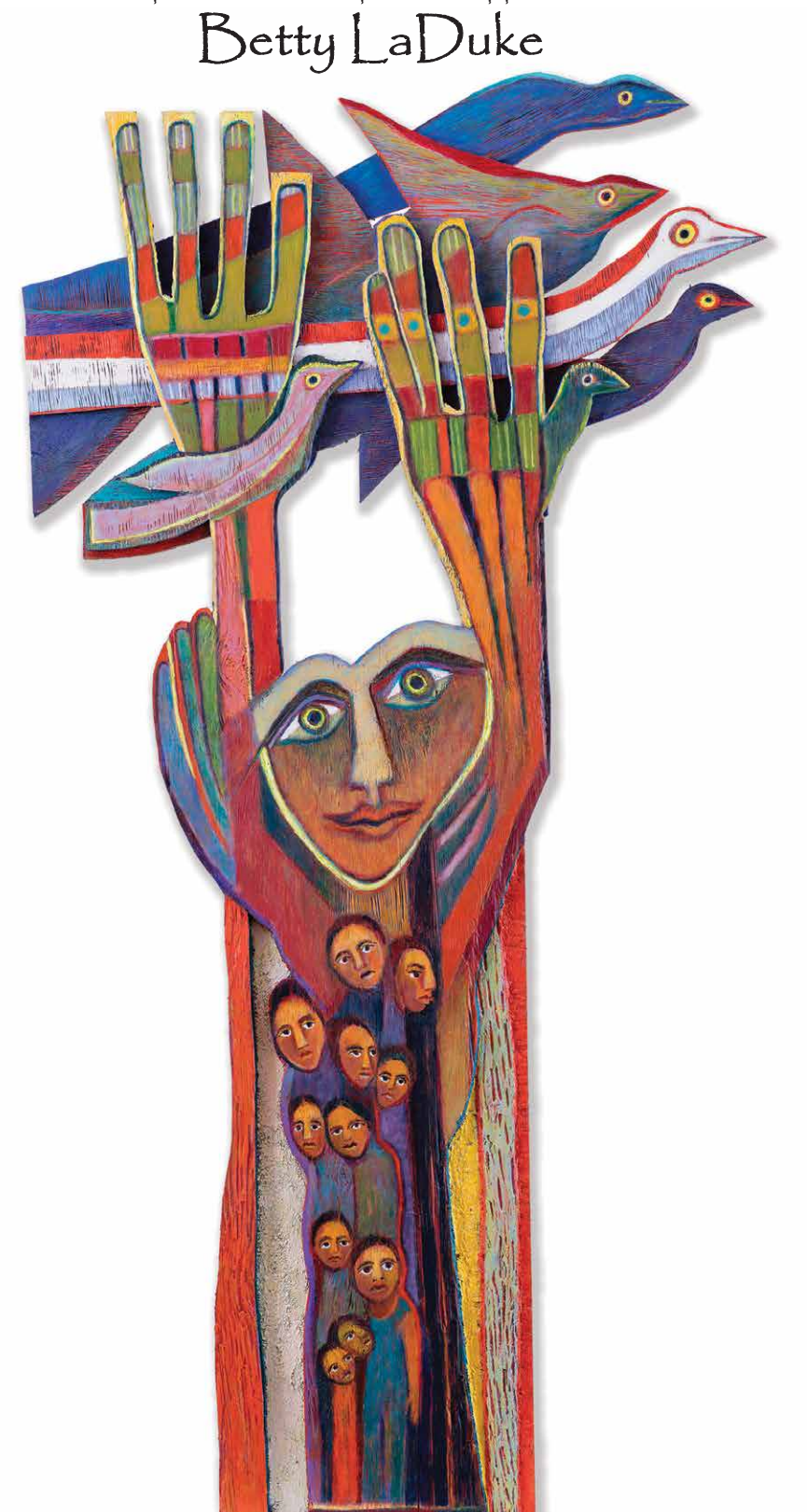
Border Children No More Cages

Panels - shaped, routed and painted (approx. 62" x 24" ea.)