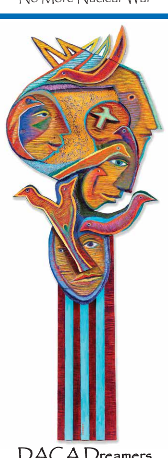
DACA Dreamers USA is Home