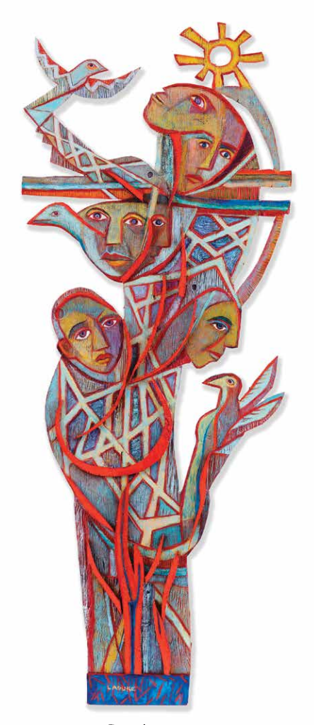
Cyclones From Alabama to Mozambíque