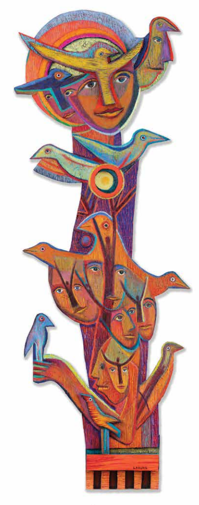
Still We Rise Black Lives Matter